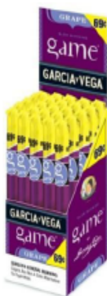
GRAPE UIN 8511123