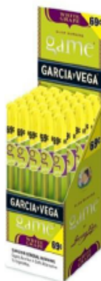
WHITE GRAPE UIN 8511115