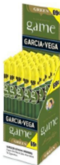
GREEN UIN 8511131